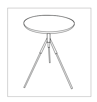
Step 2 Final Product