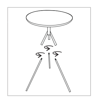
Step 1 Screwe Base all 3 legs (B) legs to top (A)

If any part is missing or damaged, do not attempt to assemble the product. Estimated Assembly Time: 5 minutes.